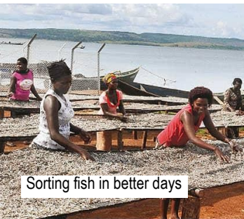
Sorting fish in better days

The Ugandan government continues to ban people from fishing (their livelihood for generations) after selling the rights to foreign investors. In the lead-up to the recent elections, the lake was opened for the people after 16 months of restrictions, allowing them to fish freely. However, it was closed again afterward, allowing just one week per month with even more restrictions. They were told to fish during the daytime & those who do fish at night are not allowed to use any lights - not even a torch. Silverfish, which is their main source of income can only be caught at night & requires light to lure them. On top of that, the fishermen still need 4 licences - one for the boat, one the engine, one the net & one just to fish.