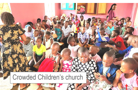
Crowded Children's church

On a brighter springtime note, our wonderful church in Kiyindi continues to grow , drawing many to the multiple services & meetings. The baptismal pool is in great demand (built by one of our former sponsored students after the government banned baptism in the lake). Despite some people moving away to find work, the building needs to be extended to accommodate more than 350 adults. They also hope to build (as they can) a venue for the children's church which currently is over 200 children; & they are also crying out for a keyboard for the ever popular Worship. New churches are being planted & other churches have also joined to come under Pastor Dan's oversight.