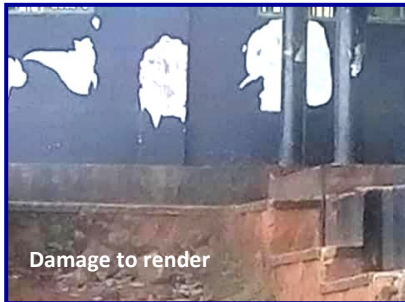
Damage to render

Due to the excessively heavy rain recently there are a number of concerning needs & damage that have to be addressed at the schools: Prayerfully prioritising the limited income of the charity is always vitally important —Staff salaries & food usually being the first, but