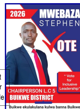
Headmaster stroke/joint overseer/local councillor with a heart for the people