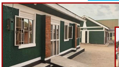
One of the Medical centre buildings