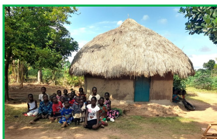
Since the year 2000 we've been working with underprivileged Orphans and Widows