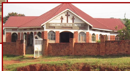
The current church building that replace the one that was taken, is so popular it's bursting at the seams.