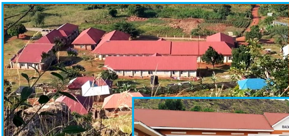
Aerial view of most but not all of the school buildings