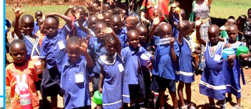
Currently over 700 hundred children in the 3 schools